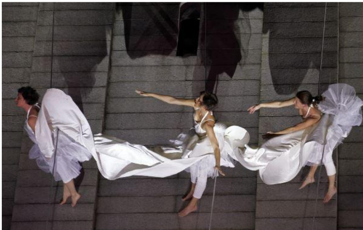
MG 1645 BY DBKING ON FLICKR / CREATIVE COMMONS

Dancers will scale a 17-story building in Boston's Seaport district for a high-flying performance on Thursday evening.